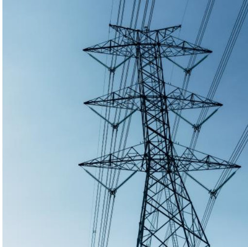
Construction of double-circuit OHL 220 kV from Sirdaryo TTP to Pechnaja SS and Metallurgija SS