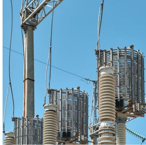
Construction of OHL 500 kV Surkhon SS – Khoja SS – Alvan (on the territory of the Republic of Uzbekistan)