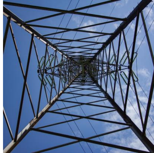
Construction of double-circuit OHL 110 kV within the project "Acceleration of constr-on of EPS facilities of Tashkent Cotton Textile LLC"