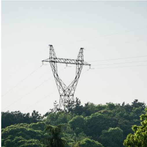
Construction of three single-circuit OHL 220 kV Nishon SS 220 kV SFES-ORU 220 kV Talimarjan TPP