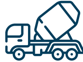
concrete and asphalt production