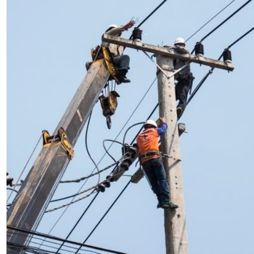
Construction of OHL 220 kV SDTES to SS Zafarobod 220 kV