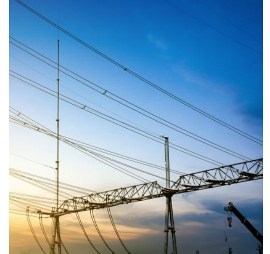
Construction of OHL 110 kV and part of SS Suffa 110/35/10 kV within the project of EPS of tourist recreational zone "Zomin"

The above is to show only some of the numerous ventures undertaken by RESBUD Group Companies.