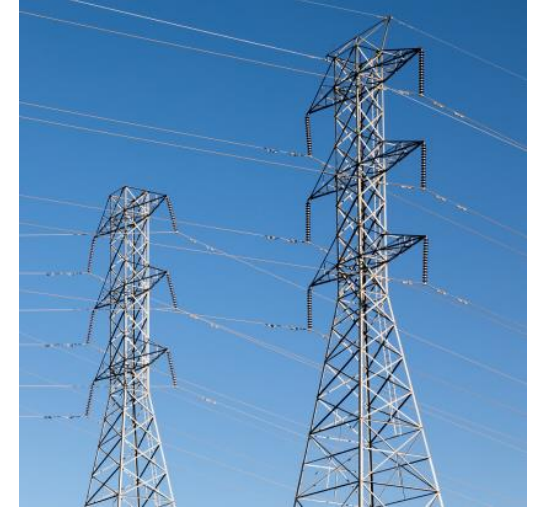
Construction of 110 kV OHL EPS of the special industrial engineering and electrical hub in Andijan district of Andijan region according to PQ-271

The above is to show only some of the numerous ventures undertaken by RESBUD Group Companies.