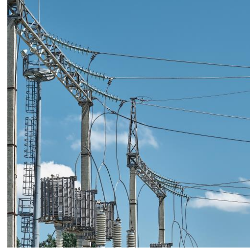
Construction of Turakurgan TPP with taps of OHL 220-110 kV